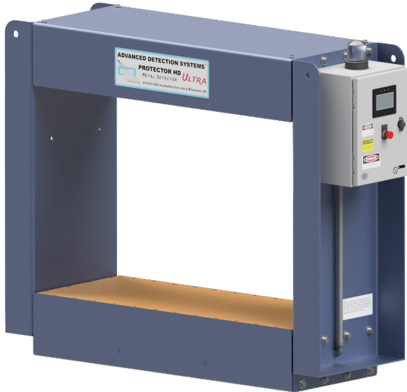
SurroundScan Protector HD Ultra Metal Detector