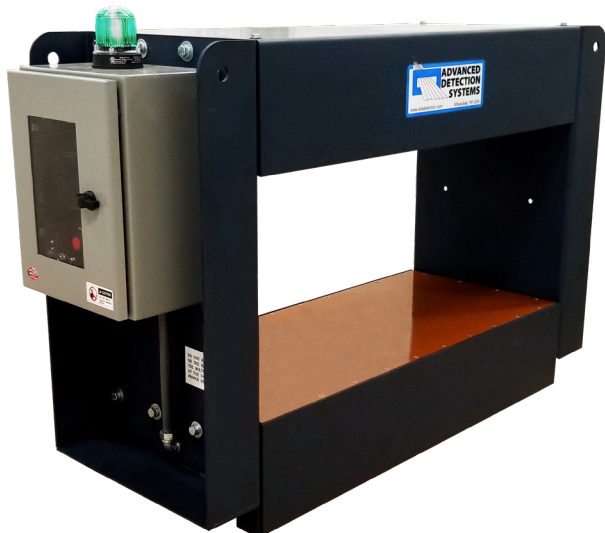
SurroundScan Protector HD Metal Detector